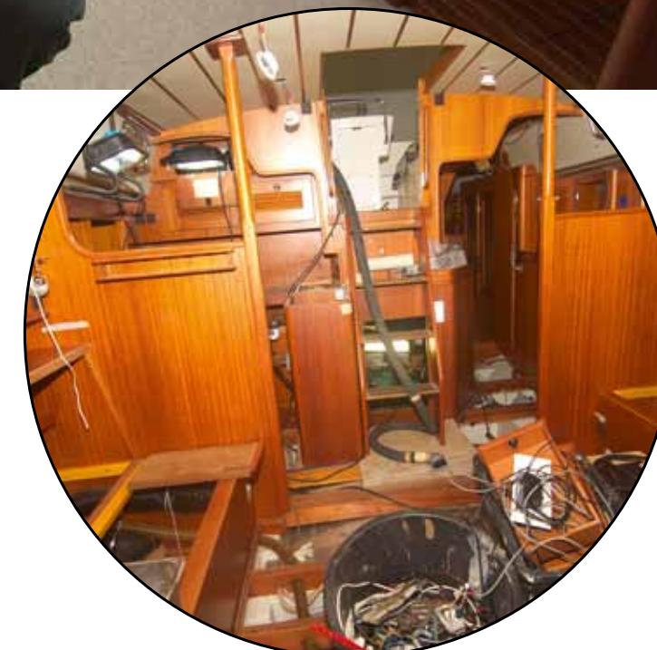
▲ Above: the boat's interior was almost completely dismantled so that everything visible and out of sight could be refurbished or replaced. The work was done in an ad hoc yard Leon Schulz set up in Sweden that used former boatbuilders from some of the best-known Swedish production builders

It is, however, not all that simple to organise a refit