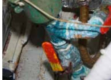
▲ Above: the yacht's engine and engine room before and after the refit. The machinery was all completely overhauled

Many models don't change that much, especially well-proven classic ones. The hull, mast, keel and rudder remain the same over the